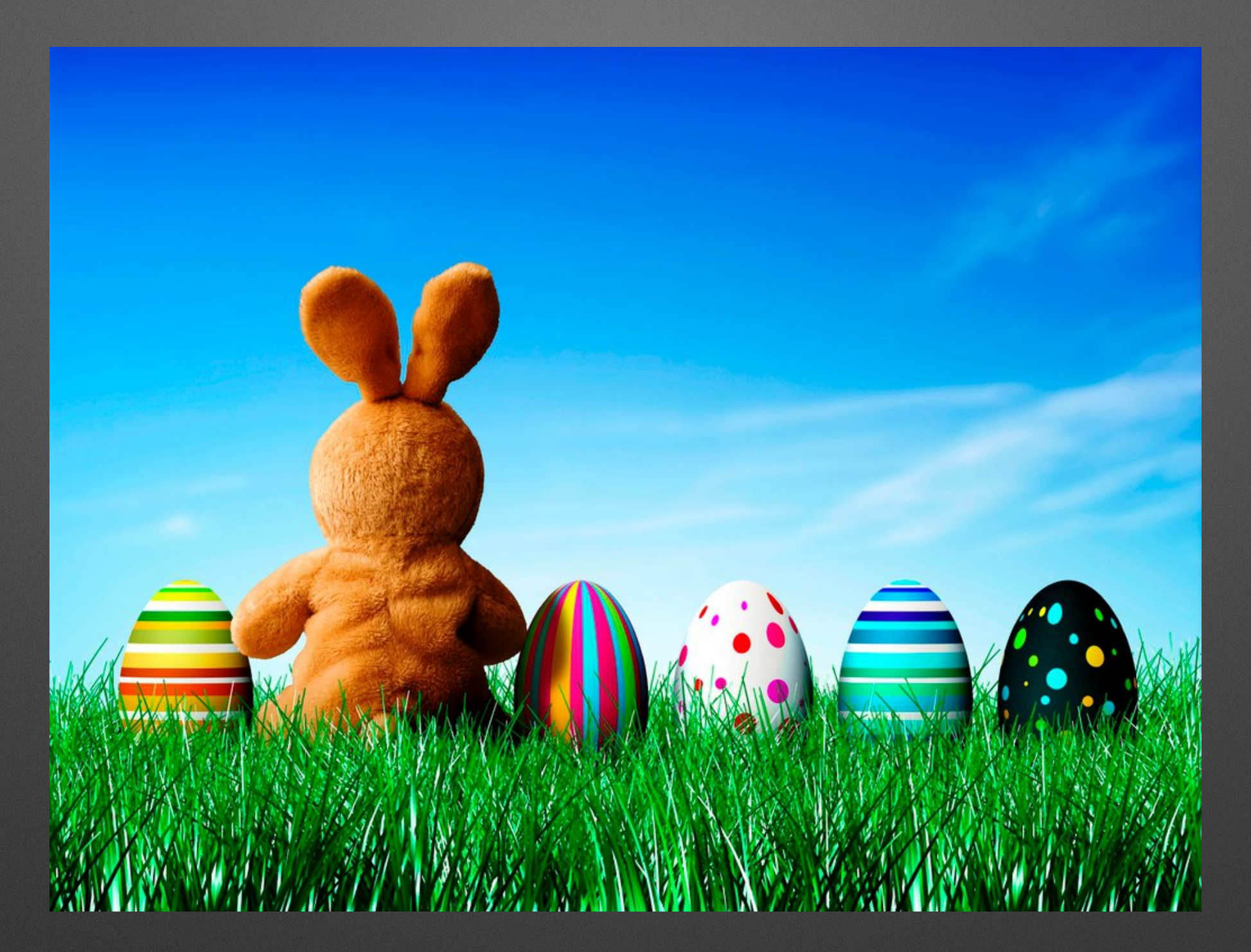
Why do we have an easter bunny and get chocolate eggs By Cj and jack