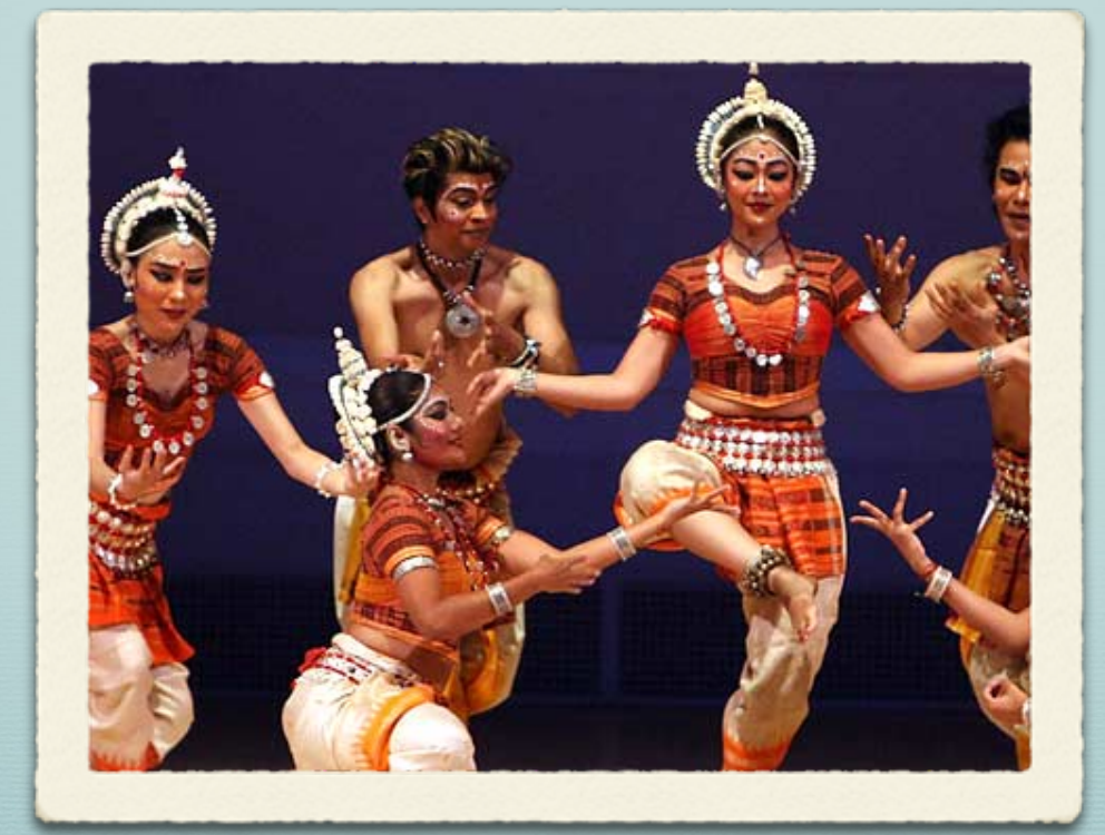
Music and dancing. What music and dances do different cultures do?